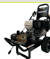
Honda Powered Trolley Mounted Pressure Washer 16lpm 276bar HP-T16276PHR-G