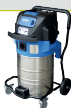
70Ltr Streamvac™ Commercial Height Gutter Cleaning System Complete - 9.1mtr WV-KIT230-10-051