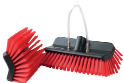
J524753-NJ2 Hi-Lo Vikan Monofilament Brush