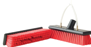
J526453-NJ2 12" Monofilament Brush