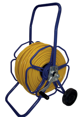
HRM400-6-UA Metal wheeled hose reel with 100mtr of 6mm Microbore hose & fittings kit. Reel comes unassembled.